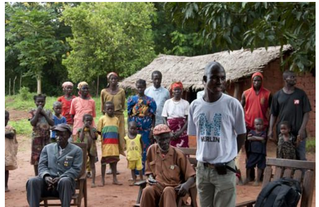
(Above) A Merlin treatment camp in Bouar, CAR.

Words do no justice to the horrors this young woman faced. After she escaped, she arrived at a Merlin supported clinic where she was treated for septic wounds on her legs and feet (she escaped barefoot), and for severe lower abdominal pain from months of sexual abuse. Merlin treated her for both her physical wounds and made sure she received psychological and social support.