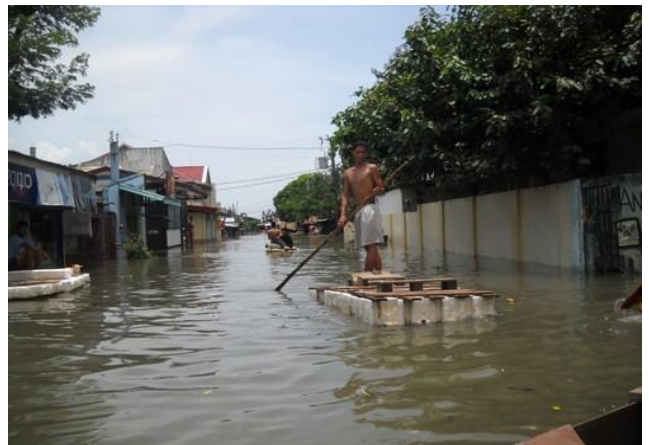
(Right) Monsoon hit the capital of the Philippines, Manila, causing widespread flooding in the capital and remote surrounding areas. Around 78 people are thought to have died and over 1.3 million were displaced.

of disease we provided essential medicine, equipment, and health education sessions. We are working hard to get health care, including desperately needed hygiene kits, to the nearly 300,000 people outside of the evacuation centers who still need assistance, particularly the thousands of young children who are most susceptible to malnutrition and disease.