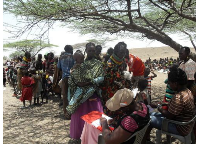
(Above) Merlin food distribution registration during an outreach visit in Turkana, Kenya.

Merlin's programs will support local health care providers with the latest training in obstetrics and treatment of childhood illnesses. Merlin will encourage the participation of village health committees and women's groups to develop educational programming for local communities. To make sure the project reaches its targeted population, Merlin plans extensive surveys and data collection in an effort to guarantee the project's long-term effectiveness.