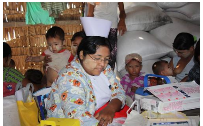
(Above) A Merlin supported midwife in Laputta, she travels out to surrounding communities providing ante natal and post natal care.

Merlin supports over 1400 Community Health Workers and Auxiliary Midwives